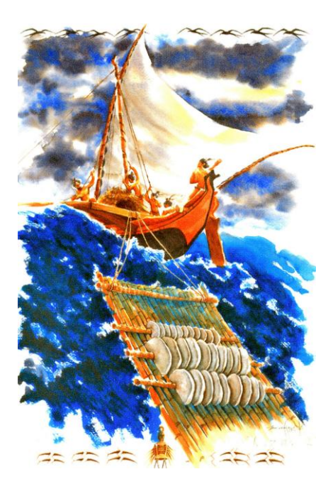
Fig. 6 Drawing of Yapese transporting stone money from Palau to Yap using a traditional canoe. (Unknown Yapese artist)

though the term 'shipwrecks' is not used in it. 'Underwater Cultural Heritage' is used in an attempt to have the 2001 UCH Convention cover all types of UCH although many of its aims do not seem appropriate to non-shipwreck sites. There are a number of other issues in how potentially inappropriate the 2001 UCH Convention is to the FSM, greater