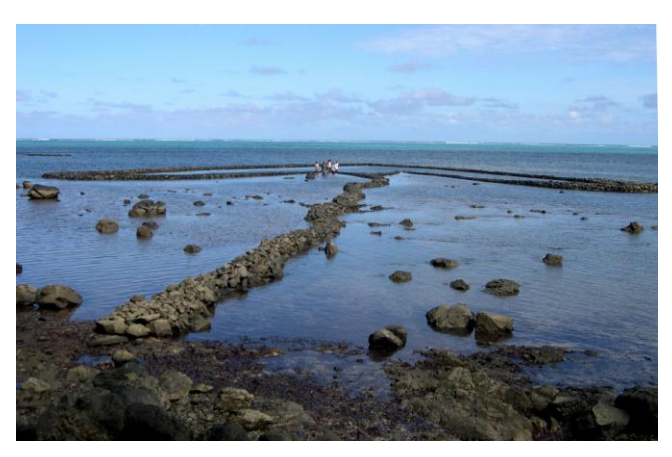
Fig. 5 Fish Weir (Aech) Daqoloch in Gagil, Yap.