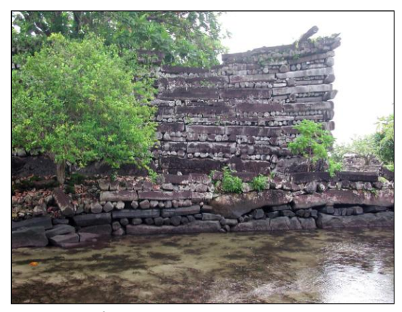
Fig. 4 One of the dominant enclosures at Nan Madol.

to Nan Madol located in the inter-tidal area and consisting of about 100 enclosures (islets) that were used by the chiefs, as mortuary compounds, and for commoners from about 800 BP. There are still strong known oral history connections with this site, although as with Nan Madol, the construction techniques used are not known.