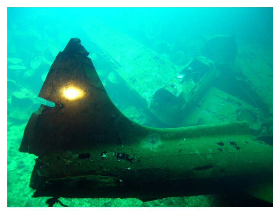
Fig. 3 World War II Japanese aircraft in the hold of the Fujikawa Maru.

Pacific. The meeting urged the protection of these sites as well as those on land that may be protected by the World Heritage Convention (UNESCO 1999) (Fig. 3).