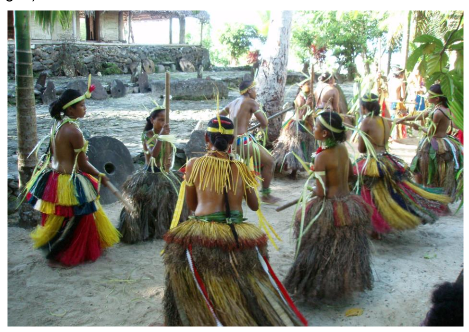
Fig. 2 Dancing is carried out in all the FSM states - this one is of Yapese dancing and chanting near a (Faluw) men's meeting house/stone money bank.

first woman arrived pregnant, sailing on a coconut frond' (Gladwin, 1970: 4). Dances, chants and storyboards convey information of these many Micronesian legends and customs (Fig. 2).