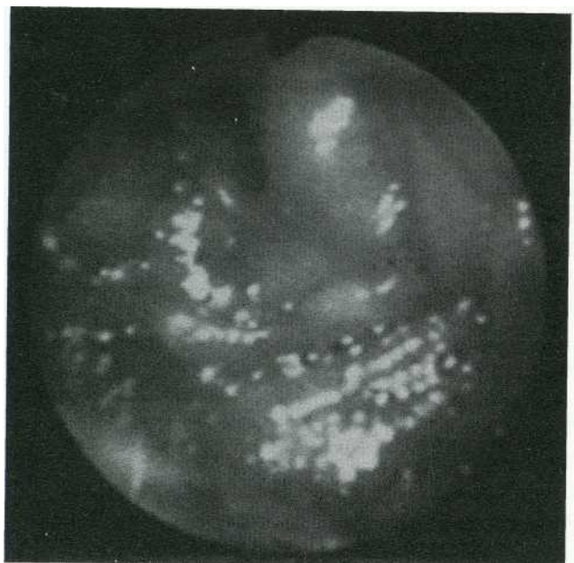
Figure 3. Enteroscopic imaging of submucosal varices in the jejunum

Because he refused any surgical intervention he was discharged and advised to continue follow-up.