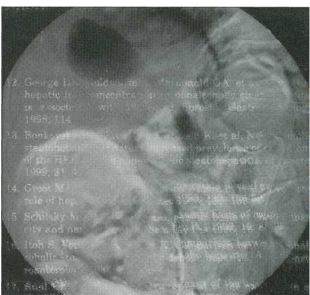
Figure 2. Angiogram disclosing fistula between the right hepatic artery and the right branch of the portal

ces and mild portal hypertensive gastropathy. On abdominal sonography, mild ascites was seen in addition to splenomegaly. Liver was fine-granular, normal-sized and its contours were mildly irregular. A well-demarcated mass (about 5 cm diameter) on the 4th segment of the liver was also seen. For differential diagnosis of the mass, color Doppler sonography was used, showing a turbulent arterial waveform with high peak systolic velocity, consistent with a hepatic artery aneurysm, and a fistula between the right hepatic artery and right portal vein. A partial thrombosis in the main portal vein, that was not present four years previously, was also documented. The described lesion is shown on computerized tomography in Figure 1. Selective hepatic and superior mesenteric angiography provided the definite diagnosis of an arterioportal fistula in the right lobe of the liver (Figure 2).