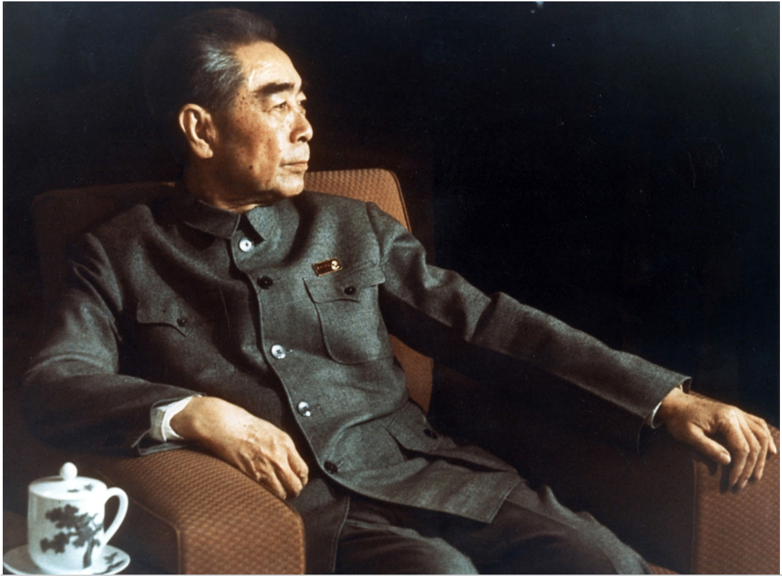
Former Prime Minister of the People's Republic of China, Zhou Enlai. (CGTN, 2017)

that time, and in a way tried to encourage Turkey to support this Third World policy. Therefore, he stressed China's intention to establish and develop relations with Turkey on new grounds, not within the bipolar blocks and ideological polarization of the Cold War.