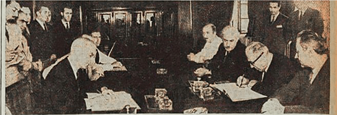
Dış İşleri Bakanımız Hasan Saka ve Amerikan Büyük Elçisi Mr. Edwin C. Wilson dün öğle üstü anlaşmayı imzalarlarken