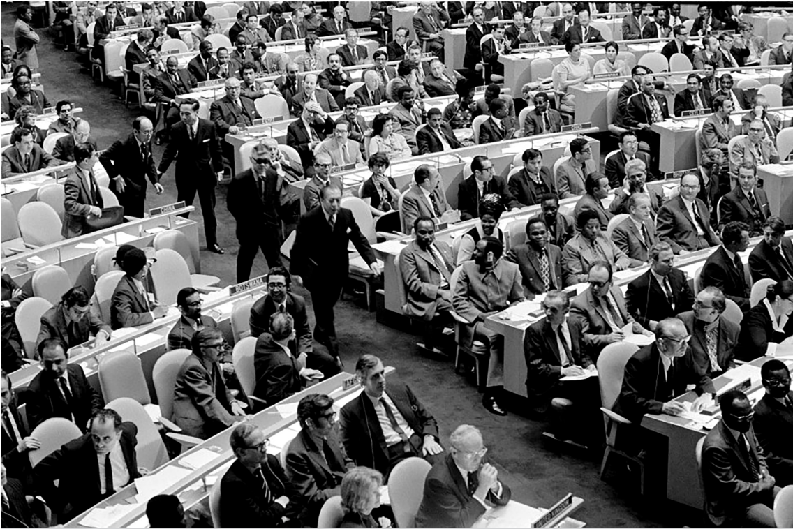
Meeting where the People's Republic of China was officially recognized at the United Nations.

today's issue. As you know, the work of the old and new governments has finally come to a conclusion... The positive results of this decision for our country, especially in terms of our economic relations and defense policy, should be clearly revealed. I am not convinced that the efforts are sufficient to ensure the continuation of our close relations with nationalist China (Cumhuriyet, August 10, 1971:7).