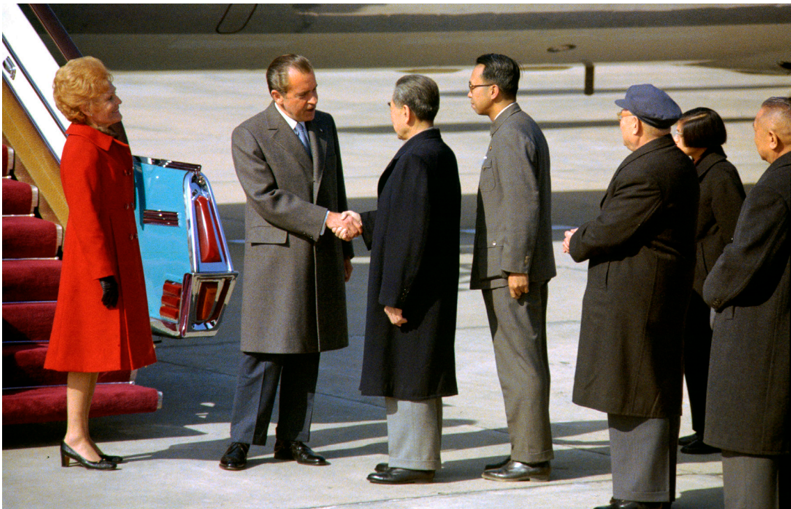
US President Nixon shakes hands with Chinese Premier Zhou Enlai on his visit to China, February 21-28, 1972. (Shou, 2020)